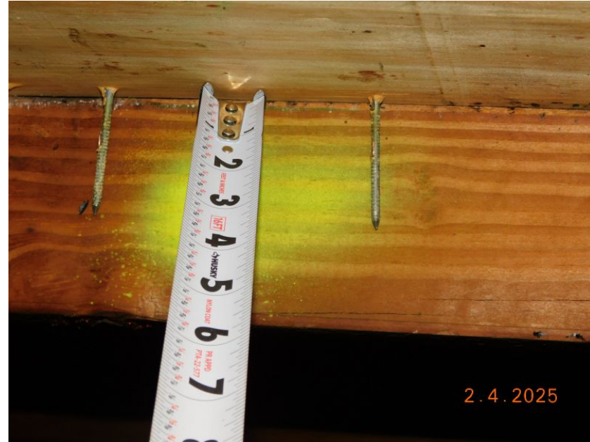
8d Nails or Greater in Size