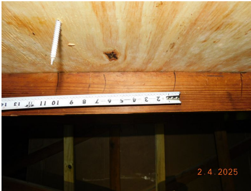
8d Nails or Greater in Size Spaced 6" Along the Edge