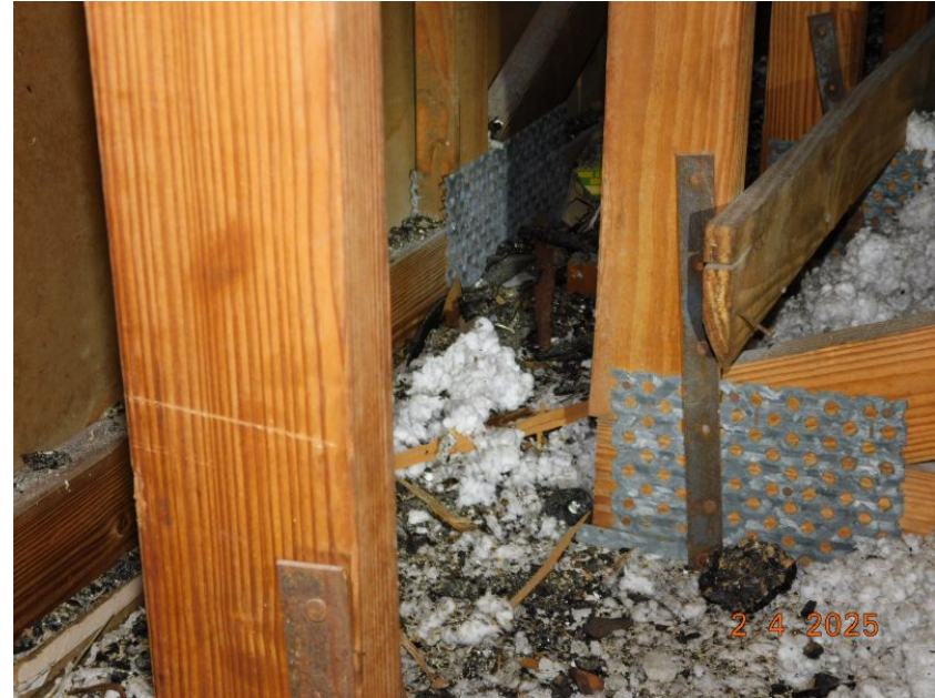
Clip With 3 Nails