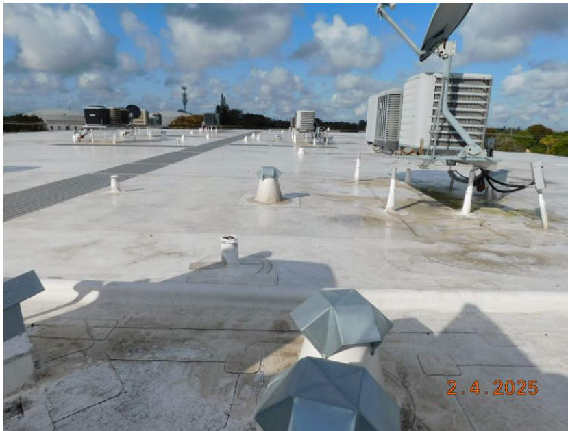
Membrane Roof Covering