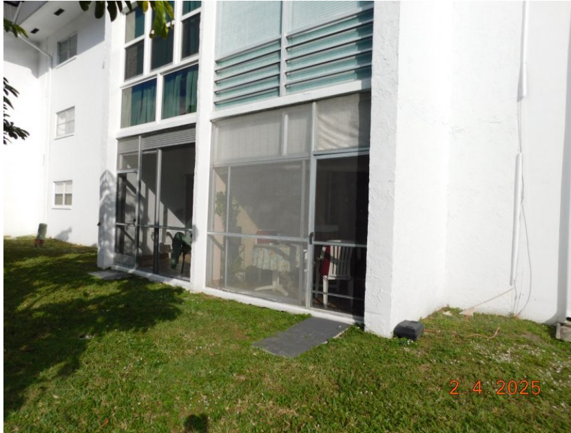
Unprotected Glazed Entry Doors