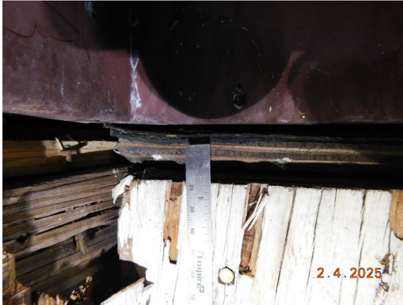
19/32" Deck Thickness Confirmed