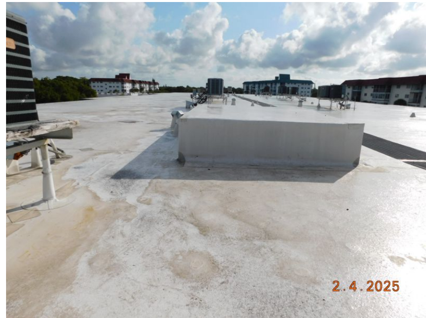
Membrane Roof Covering