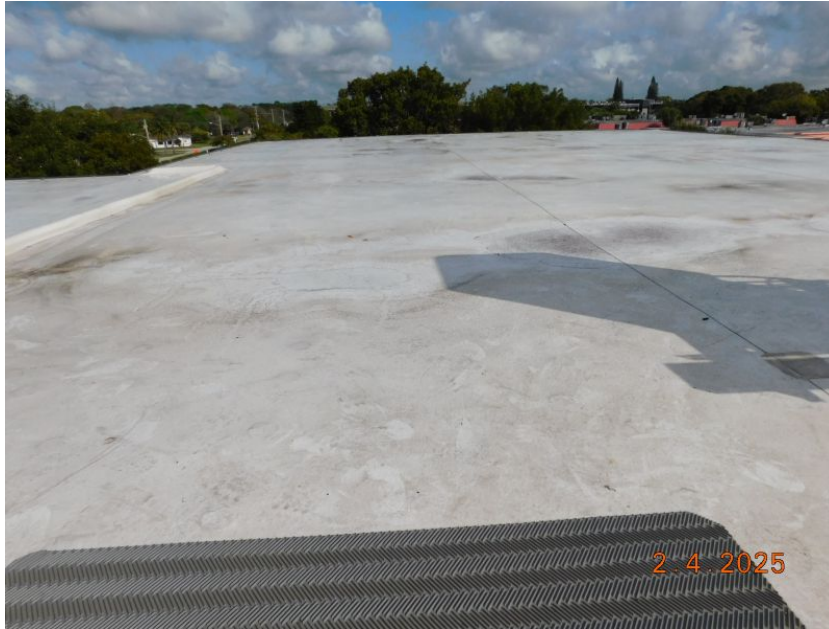
Membrane Roof Covering