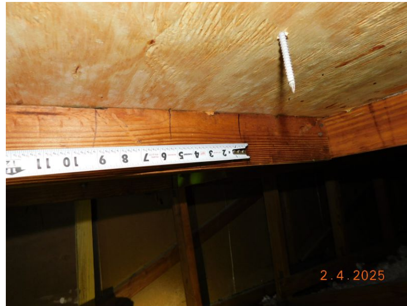
8d Nails or Greater in Size Spaced 6" in the Field