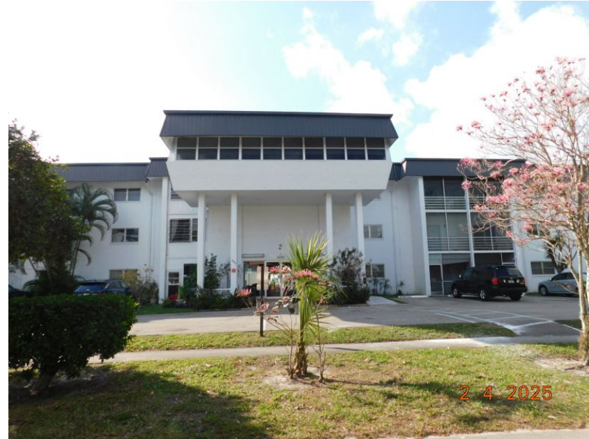
Additional Front Elevation Vantage Point