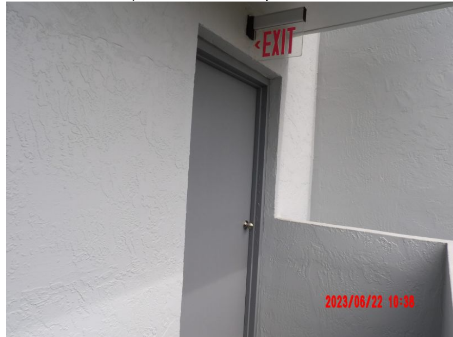
Unprotected Solid Entry Door