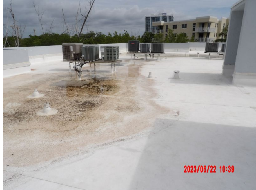
Engineered Plastic/Rubber (Flat) Roof Covering