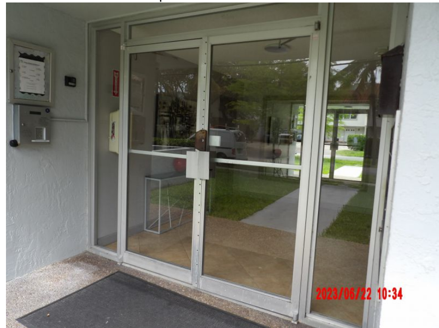
Unprotected Glazed Entry Door