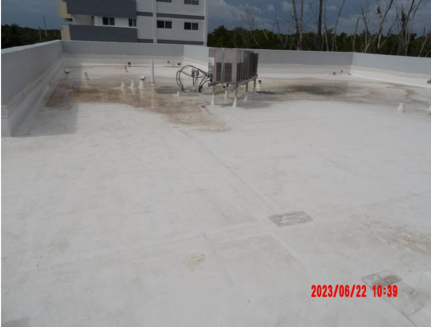
Engineered Plastic/Rubber (Flat) Roof Covering