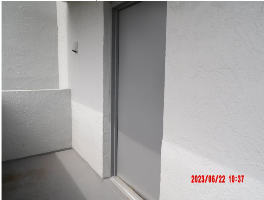
Unprotected Solid Entry Door