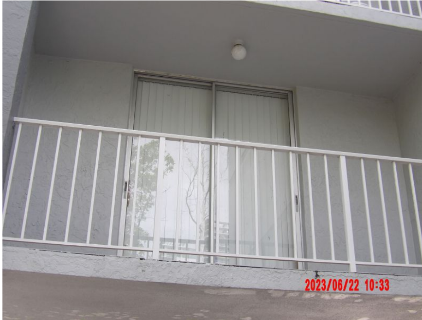
Unprotected Glazed Entry Door