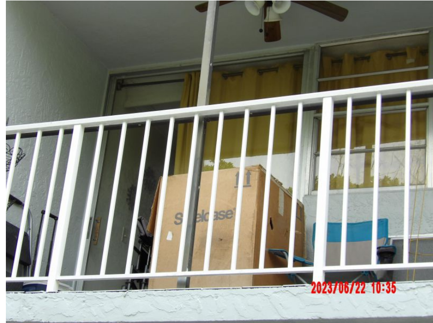
Unprotected Glazed Entry Door